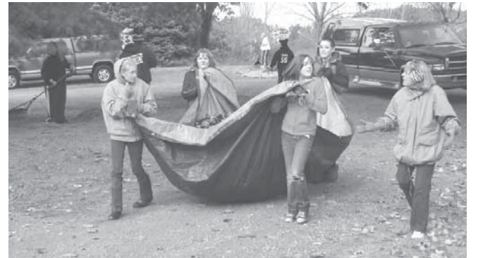
Fremont Lions and Leos teamed up to remove truckloads of leaves at an elderly person's and eliminate a fire hazard.

Clubs should take the initiative and spread the word about what they are doing and why they are doing it. A picture with a caption doesn't explain why you are holding a spaghetti dinner. It doesn't tug at the heart strings. It doesn't get people excited about getting involved.