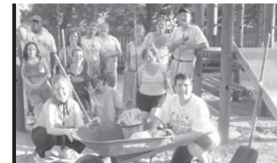
Members of the Selfridge Macomb Lions Club.