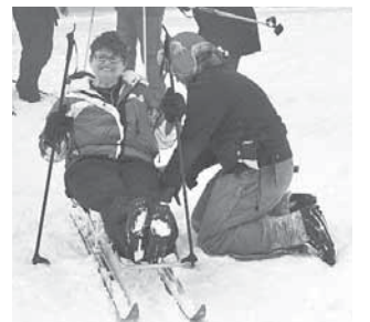
Lions help with "Ski for Light," an event that promotes physical activity for visually and mobility impaired adults.

Lionism is a rewarding experience, and Lions should be proud of the work they do. They go about their business without expecting to be recognized, but it's time to change that way of thinking and get caught in the act of Lionism. Its time to blow your horn and spread the excitement and good feeling that Lionism offers to its members. Report your club stories to your District Editor for publication in the Lion Pride Magazine. Their emails are listed below.