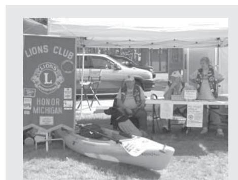
The Honor Lions Club held their annual Kayak Raffle over the 4th of July.