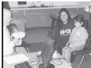
The Kalamazoo Lions Club has screened over 1,200 children this year.

Project KidSight is a program designed to detect vision problems in pre-verbal children.