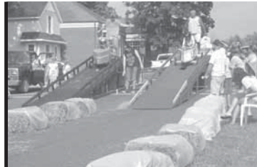
The Almont (H.O.P.E.) Leo soap box derby car prepares for a heat during the Swinging Bridge Festival.