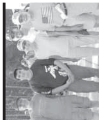
Cadillac Lions serve lunch to bikers during the Make-a-Wish Ride...