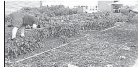
Gaines Area Lions weed and harvest the victory garden.