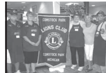
Comstock Lions Club received a Certificate of Accomplishment.