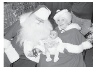
Bay City Lions host a Christmas party for hundreds of local children. Each receives a toy and club members dress up as Mr. and Mrs. Claus and Santa's helpers.