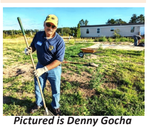
from East Jordan raking debris.

East Jordan, Central Lake, Cheyboygan, and Hillman Lions helped clear debris from the Gaylord tornado. United Way and Habitat for Humanity workers were also there.