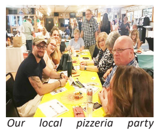
attendees attend every year! Below, guests and lions tucking into hor's doeurvres and cheeses galore!

The USA Lions Club Annual Cheese and Wine Event was a great success and the best yet with over $5000 netted from the evening. Volunteers and guests were treated to wines, cheeses, incredible auctioned bakery and wine goods, and a wine-erful evening was had by all. Thankyou everyone who attended.