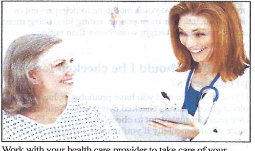
Work with your health care provider to take care of your prediabetes.

If you're overweight, losing 7% of your total weight can help you a lot. For example, if you weigh 200 pounds, your goal would be to lose 15 pounds.