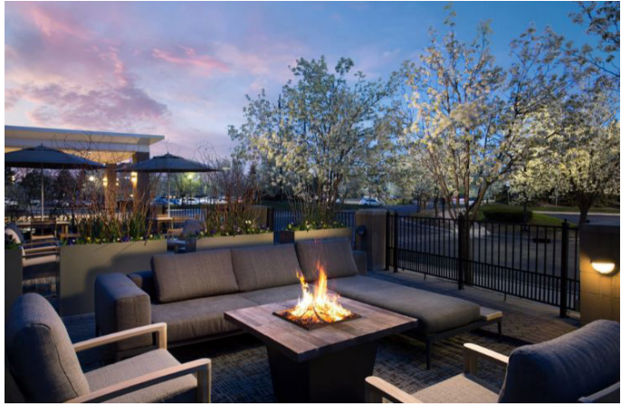
Beautiful FIREPIT lounge At the Auburn Hills Marriott

Educational breakout sessions, vendor tables, exhibits and the silent auction are all convention traditions and it's exciting to be planning once again. We're coming back bigger and better in 2022, and you won't want to miss out! Reservations are now being accepted at 248-628-6016 at the special rate of $89.00.