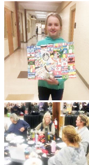
Metamora Lioness Lions held their Ladies Shrimp Night Fundraiser November 11th.. They had over 250 women attend who enjoyed a night of drinks, games, raffles, 50-50s, and AYCE and potato bar. shrimp