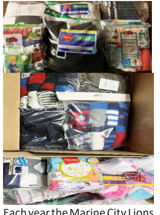
Each year the Marine City Lions Club tries to help a local family or organization this time of year. This year the club chose to help Kids in Distress with items they are in need of. They started an amazon wishlist and the support from the community has been amazing!