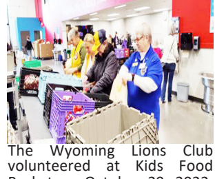
Basket on October 29, 2022.

Rockford Lions Club hosted a community can drive at their local Choice One Bank. Great job Lions!