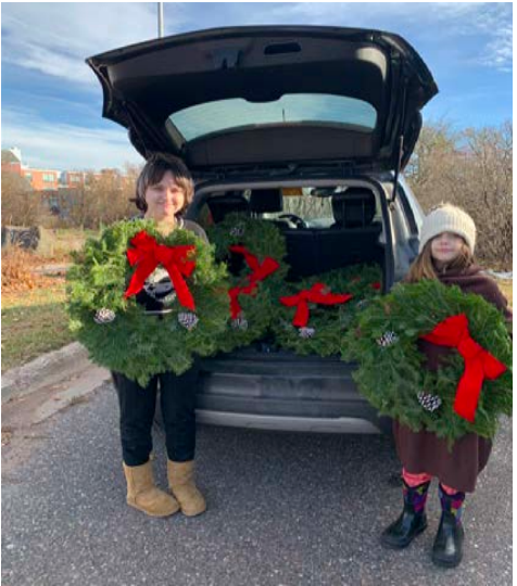
Santa's helpers selling wreaths for the Marquette Lions Club