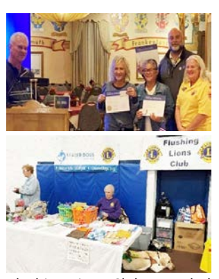
Flushing Lions Club attended the St. Robert's Craft Show and the Flushing Women's Club Craft Bazaar in November selling their famous dryer balls and handmade items. other

Frankenmuth Lions Club the Since May 2022, Frankenmuth Lions Club has been conducting an active recruitment campaign active recruitment campaign to attract new members, including the development of a new video highlighting the club and hosting two recruitment events at their Lion Haus. The video can be viewed on the club website at http://frankenmuthlionsclub. com/. These efforts have resulted in the recruitment and induction of 17 new members since May. The latest new members were inducted new members were inducted in October and November.