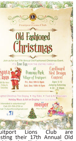
Fruitport Lions Club are hosting their 17th Annual Old Fashioned Christmas Event 9th-10th. December From havrides to holiday music, and a Cardboard Sled Contest for the kids, everyone is sure to have a holly jolly good time.