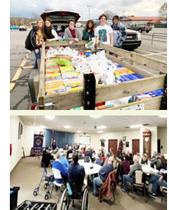
St Joseph Lions were in a celebratory mood at their meeting which included a visit from five area basketball coaches. We raised over $600 for the Goodfellows drive and kicked off our Toys for Tots drive.

Mattawan High School LEO Club participated in an annual food drive for the Mattawan Area Pantry and were able to bring in nearly $2000 in cash and food. Through the generosity of Wagoner's Grocery Store and the Mattawan community, our neighbors in need will be blessed with food and necessary provisions. Great job LEOS!