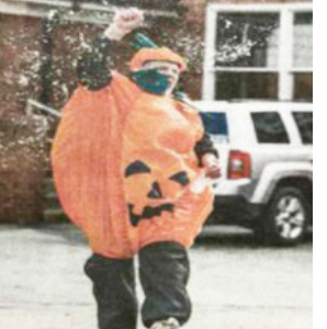
A Vassar Lions Club volunteer was on the wrong end of a water balloon during the annual Vassar Pumpkin Roll.