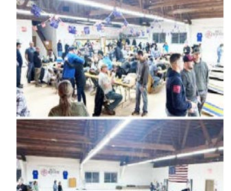
Onekama Lions Club- Another great turnout for Friday night cornhole and good times at the den! The Lions Club appreciates everyone who comes to play, eat, or enjoy some cocktails.